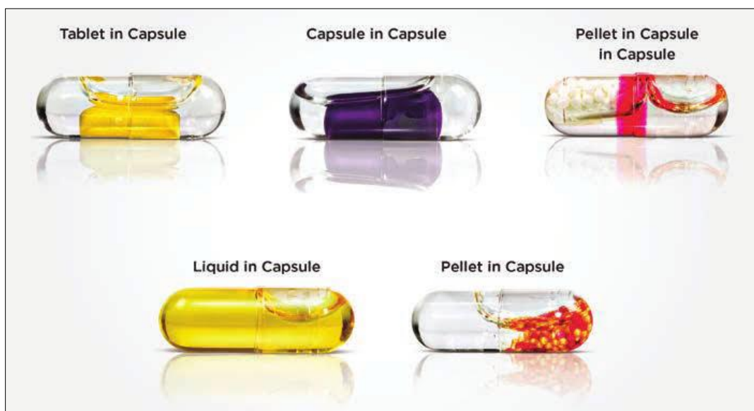
Figure 1 Different types of Capsules

In the world of Novel drug delivery system to overcome the drawbacks of conventional dosage form like immediate release, fluctuation in plasma concentration, the evolution in capsule system have led to develop the capsules that facilitates the controlled drug delivery, sustained and targeted release profiles with its own benefits as conventional dosage form. The advancement in capsules has led to the formation of different types of capsule formulations such as tablets in capsules, pellets in capsule and the capsule in another capsule, liquid in capsule products and pellets in capsule formulations.