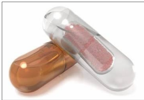
Figure 2 Capsule in Capsule Formation