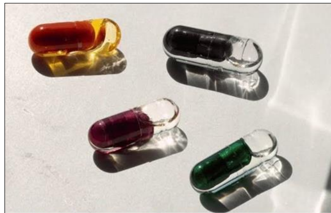
Figure 3 Duocapsules