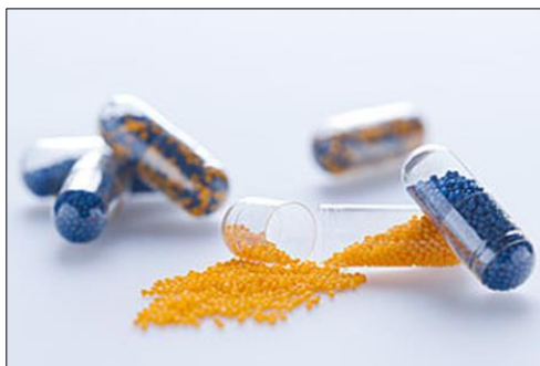
Figure 4 HPMC Capsule Shells