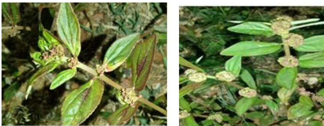
Figure 1 Roadside weed- Euphorbia hirta

The aqueous extract of E.hirta shows slight toxic effect in reproductive system of male rats by retrogression and reducing the mean diameter of seminiferous tubules. The Shrimp lethality assay results the toxic level LC 50 values almost 1mg/ml and so great vigilance should be taken while administering the herbal drug. It is possibly unsafe for pregnant and lactating condition as it might cause contraction of uterus [8, 29]. Overdose of E.hirta shows increased biochemical factors (ALT, AST, BUN, total bilirubin and creatinine) levels in rats. Deleterious effect on grazing rats shows the source for toxicosis. Allium cepa test shows genitor-toxic and mitodepression effect of E.hirta in the methanolic extract [7, 30]. Histo-pathological report shows Damage of murine liver, kidney and aorta has been reported with increased biomarkers [ALT & AST] level at toxic dose. Crude extract shows more toxic in kidney cell lines of monkey [31, 32].