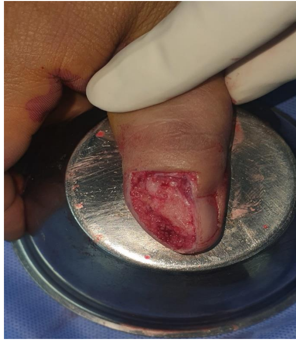
Figure 5 Result after surgical excision using Mohs micrographic surgery