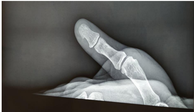
Figure 4 Absence of bone lysis on hand radiography.

Furthermore, the patient denied any history of exposure to radiation, chemicals or repeated trauma to the affected finger. The patient underwent surgical excision using Mohs micrographic surgery. After partial avulsion of the nail plate, a poorly delineated erosion approximately 5 mm in diameter was visible within the distal part of the lateral nail fold (Figure 5). Postoperatively, the patient noticed a sensation of hypoesthesia in the treated area, which regressed almost completely over the following months.