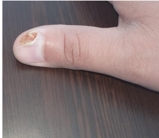
Figure 1 Verrucous lesion on the medial border of the right thumb progressively increasing in size

The lesion was painless, with no inflammatory signs and no evidence of trauma. It was evolving in a context of apyrexia and preservation of general condition. The patient initially consulted a family doctor, where he underwent a biopsy. Histological analysis of the biopsy material revealed epithelial proliferation throughout the entire epithelial thickness, characterized by cytoarchitectural disorganization over the entire height of the epithelium, with an anarchic arrangement of keratinocytes (figure 2).