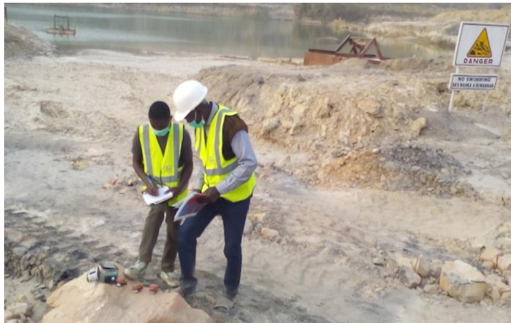
Figure 4B Air Quality Assessment at Maiganga Coalmine, Field work, 2019