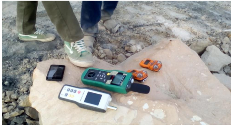
Figure 4A A cross section of Air Quality Monitoring Equipment,Field work, 2019