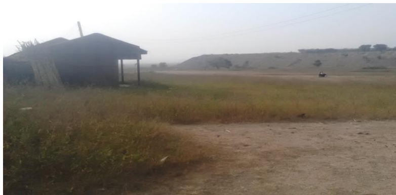
Figure 4C Photograph of houses bordering the Coalmine, with open space exposed already to the impact of Particulate Matter on Maiganga Community, Field work, 2019