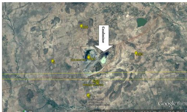
Figure 3 Google Earth of Maiganga Coalmine Showing Sample Points Indicated In Yellow Spot