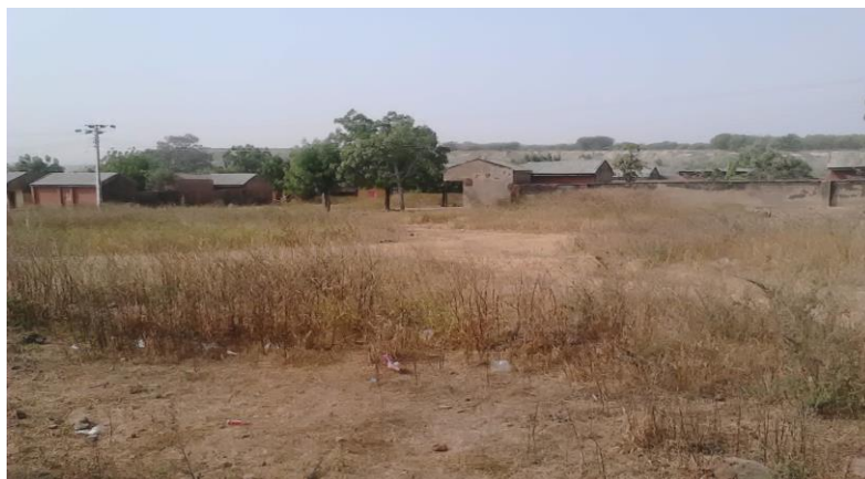
Figure 4C Photograph showing houses and vegetation in Maiganga Community