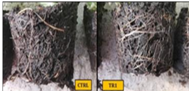
Figure 3 Detail of roots and root hairs in plants treated with Trichoderma spp.. Increased root development in terms of size and root hairs with the TricorrP5 treatment (Tr1) compared to the untreated control (CTRL)