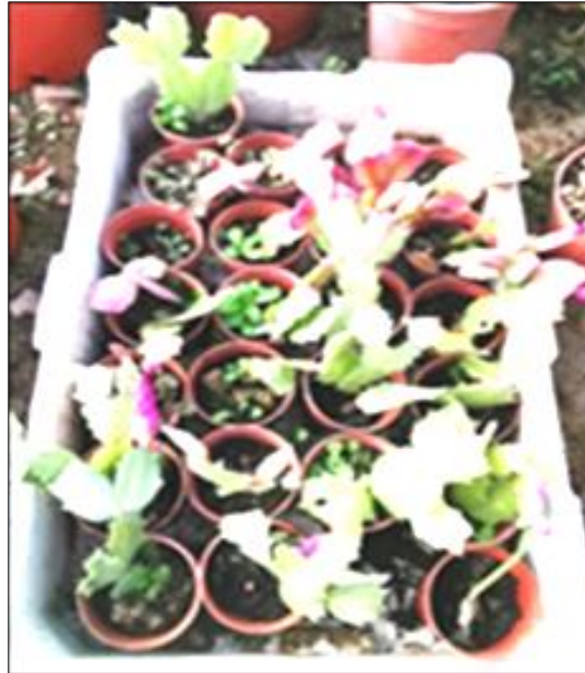
Figure 1 Schlumbergera russelliana rooted cuttings in CREA Vegetable and Ornamental Crops greenhouses