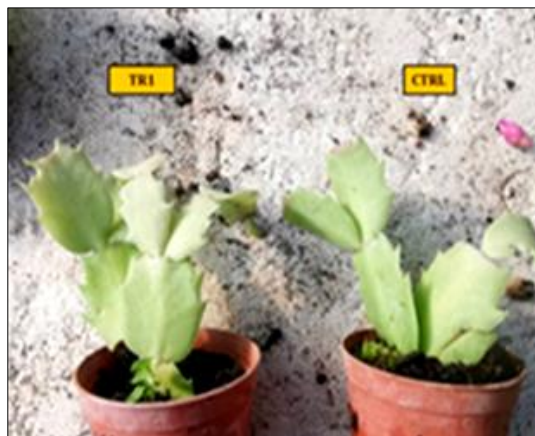
Figure 5 Increased number of new shoots in the TricorrP5 thesis (TR1) compared to the untreated control (CTRL)