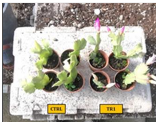
Figure 4 Flowering plants on TricorrP5 thesis (TR1) compared to the non-flowering control thesis (CTRL).