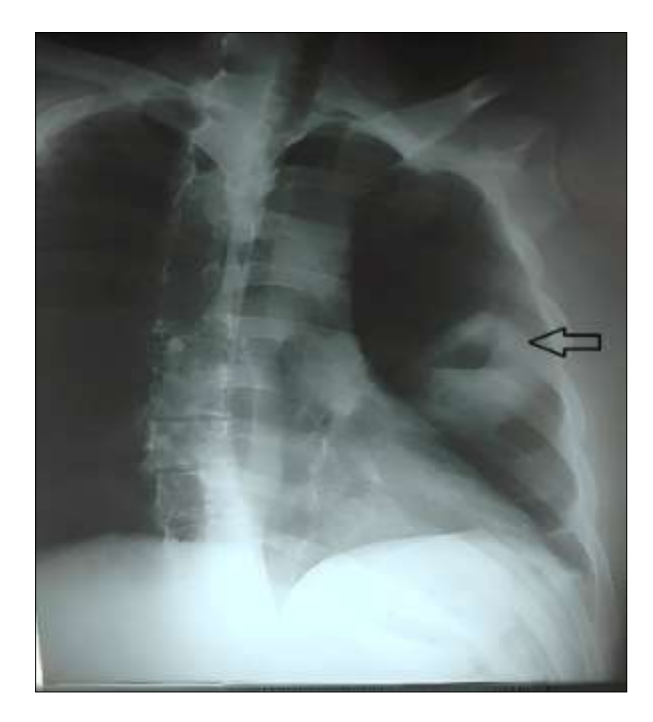
Figure 2 Sunsenquent anterior posterior chest X-ray

A subsequent X-ray demonstrated a cavitated mass of 6 cm and bilateral paracardiac basal nodular images on the left side, appearing cavitated [Figure 2].