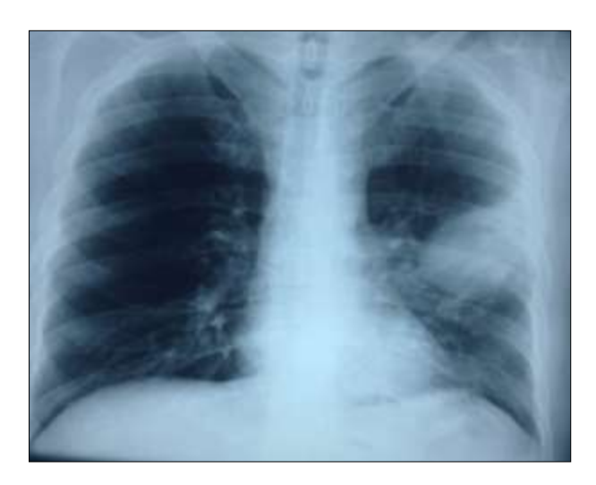
Figure 1 Initial anterior posterior x-ray

The patient, a cattle rancher, reported social alcohol consumption approximately three times a week and denied any other relevant personal medical history. Physical examination revealed tubular breath sounds in the left lung field. Radiographic evaluation included a chest X-ray, which showed an opaque mass in the middle basal zone of the left lung [Figure 1].