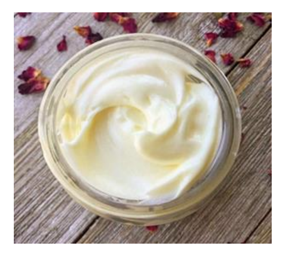
Figure 1 Herbal Face Cream

Exfoliation is a procedure that facilitates the removal of dead skin cells and leaves the skin feeling smooth and soft by clearing the surface of the skin of debris and excess oil.[12] Exfoliation originated in Egypt, where the ancient Egyptians utilized it with the aid of pumice and alabaster stone fragments. Some scrubs were created from herbs and sand. China and Asia also used the exfoliation method.[13,14] During the middle Ages, tartaric acid from wine was employed as a chemical exfoliant. Exfoliating the skin is done using scrubs and chemical peels, and cosmetic products have supplanted certain outdated methods. A few synthetic and botanical raw ingredients are utilized as exfoliants.[15,16]