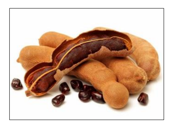
Figure 4 Tamarind Seed